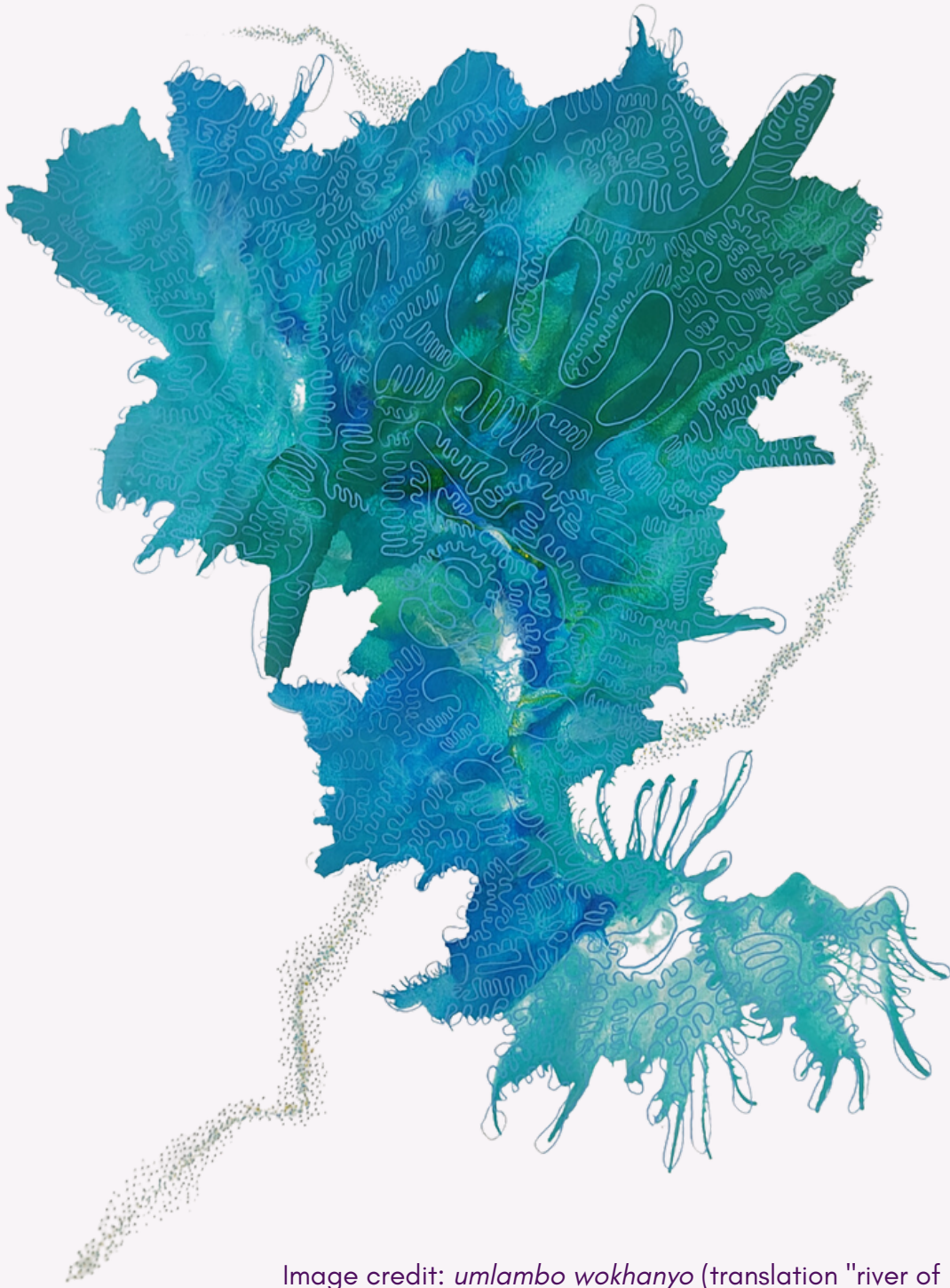
Image credit: umlambo wokhanyo (translation "river of light") by Sisonke Papu // KHNYSA

"This work is an on-going exploration of 'izithunywa zendalo: amanzi' (messenger of Nature: water (element)), and centralizes the fluidity of breath. The river of light can also be considered as the energy system that runs through our nervous system, which in turn represents the veins in plants and river systems both above and below the Earth."