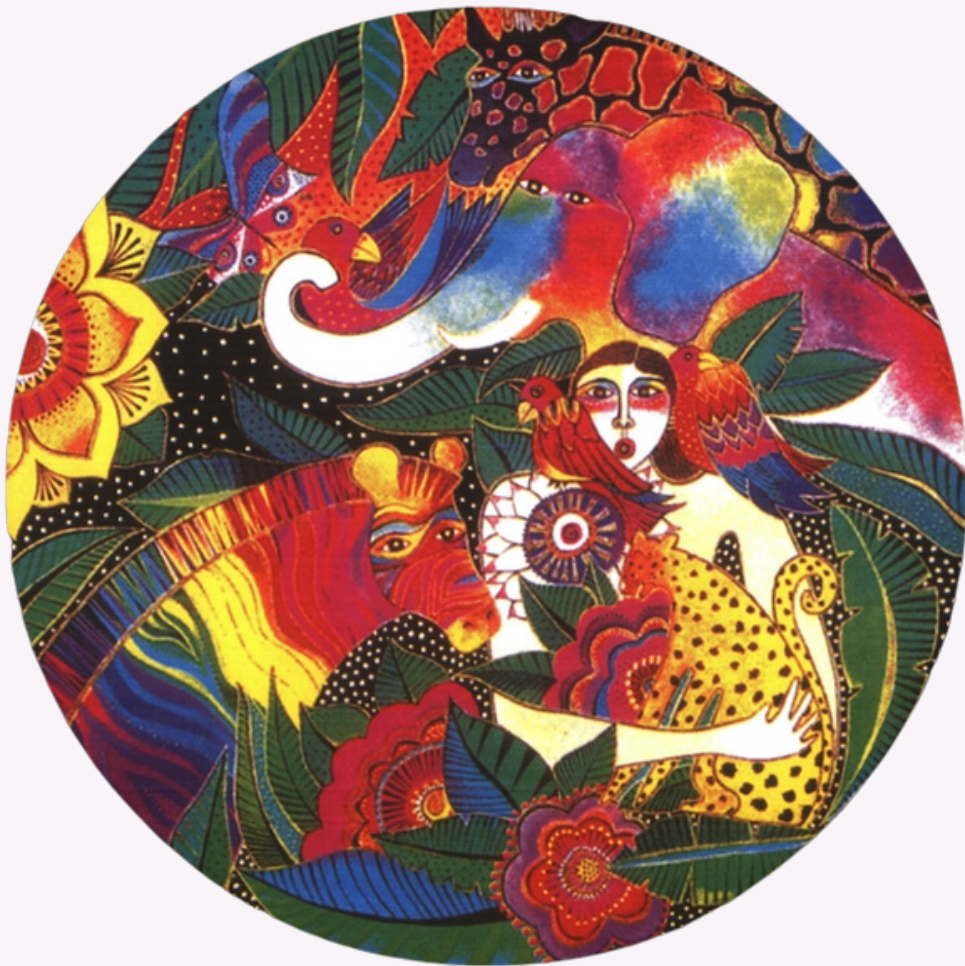
Image credit: Protecting Diversity, Resisting Monocultures, and Fighting Monopolies - DWD